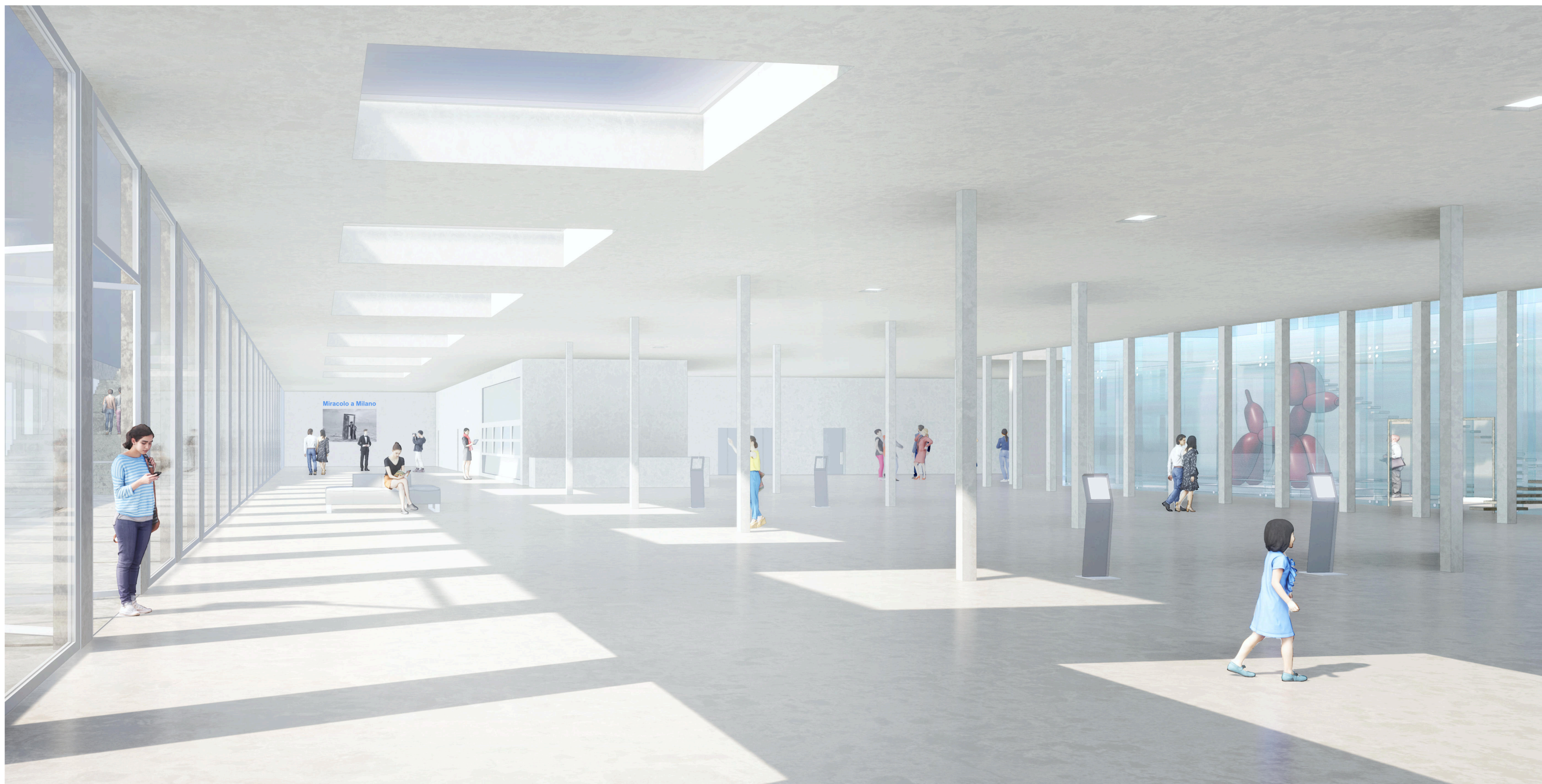
Perspective of the Atrium Promenade