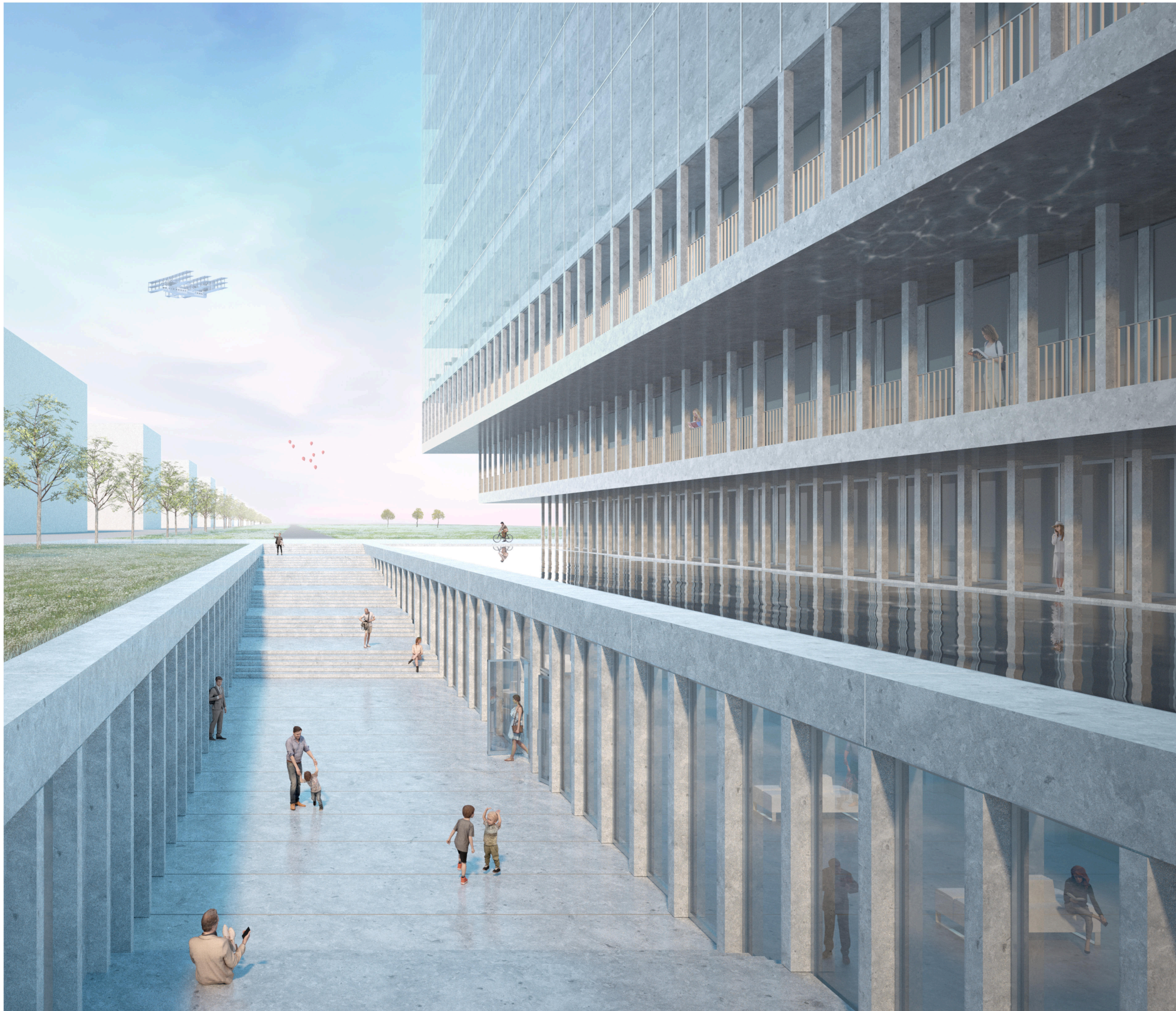
Perspective of the Entrance Promenade