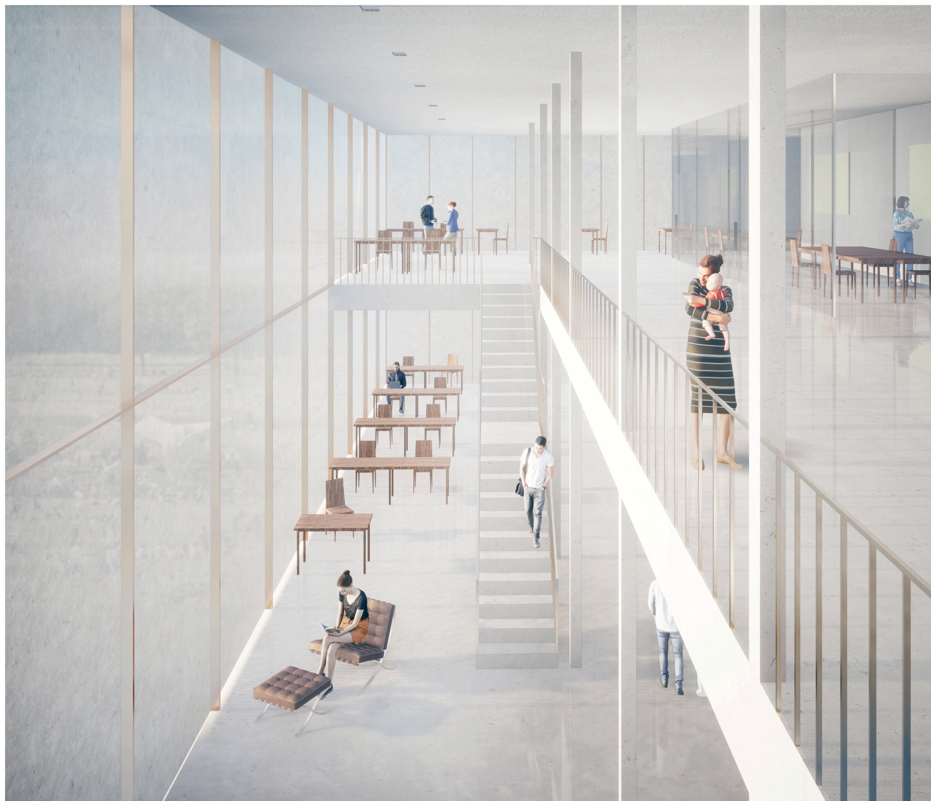
Perspective Reading Space in Third and Fourth Floor

From the interior, the facade material doesn't block the view of people, thus ensuring that the contact with the park is maintained at all times and taking advantage of the natural light in the reading rooms.